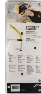
3 Swimmer's Snorkel: packaging, back view