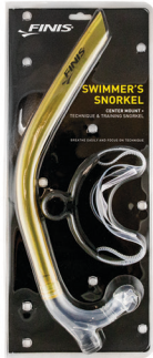
1 Swimmer's Snorkel: packaging, front view